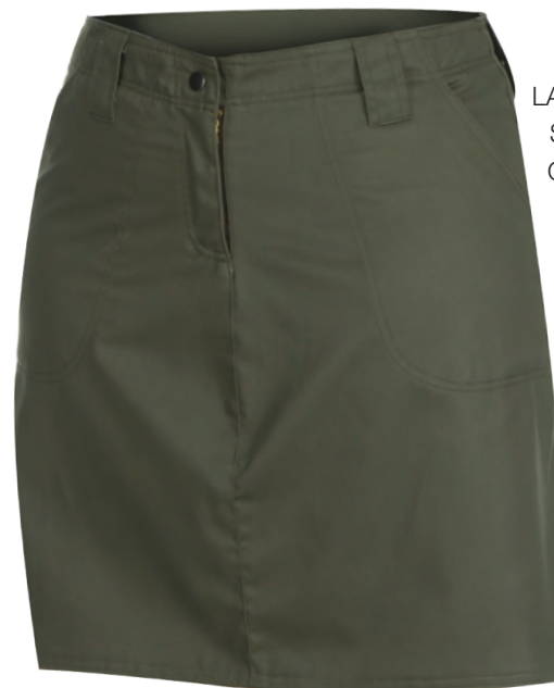
LADIES Skirt Olive

Stylish and practical skirt available in Stone, Sage and Olive