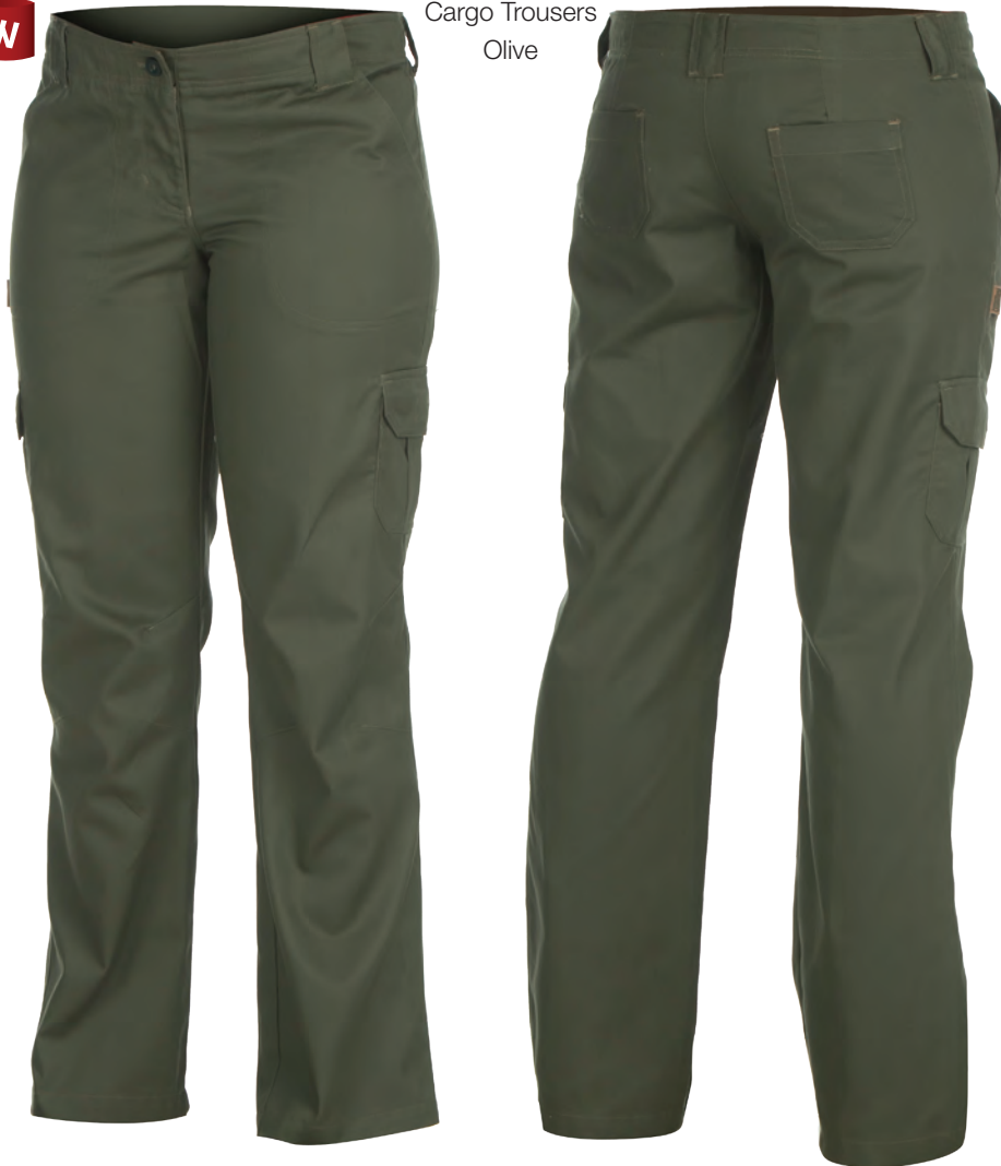
LADIES Cargo Trousers Olive