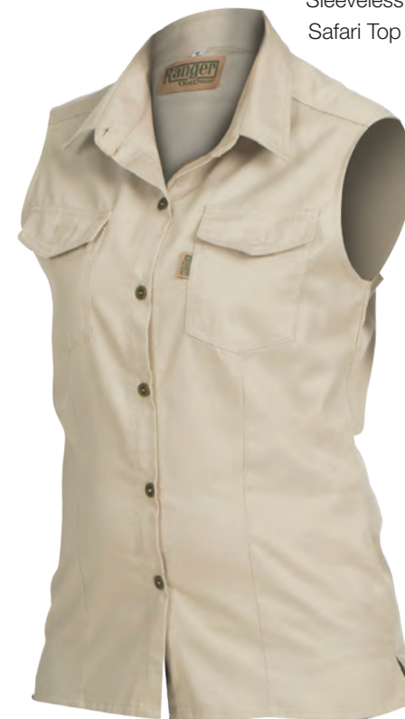
LADIES Sleeveless Safari Top

Fabric: 190g 65/35 Poly/Cotton Bushblend fabric available in Stone, Sage and Olive