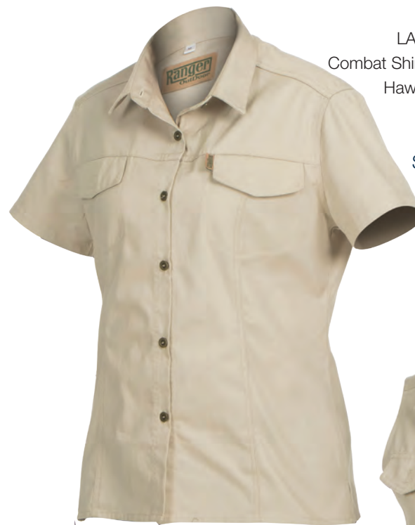
LADIES Combat Shirt Short Sleeve Hawk Style

Soft and durable finish, generous cut, sleeveless for sporty look and wear.